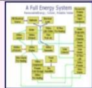
Priority No 3 CO-GENERATION Generate 280 units of work from 100 units of energy input