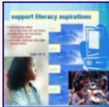
Priority No 1 Braille Classroom replicable anywhere